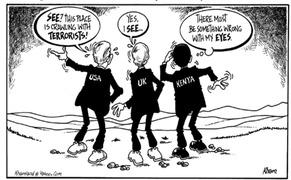
Figure 5: US, UK and Local Perception of Kenya's Terrorist Threat