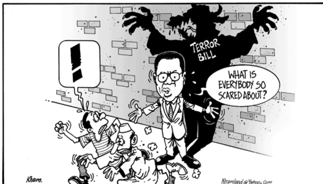
Figure 4: Kenya's Anti-Terrorism Legislation

Source: Editorial Cartoon, East African Standard , July 17, 2003