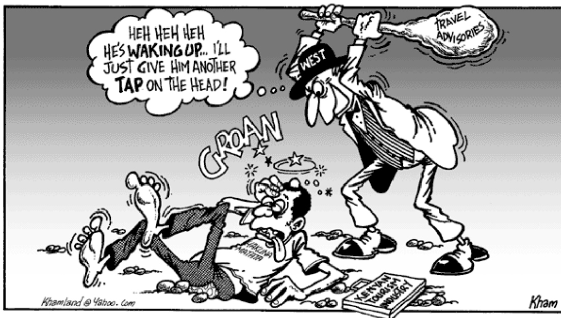
Figure 3: Effect of Travel Advisories on Kenya's Tourism Industry

Source: Editorial Cartoon, Sunday Standard , December 21, 2003