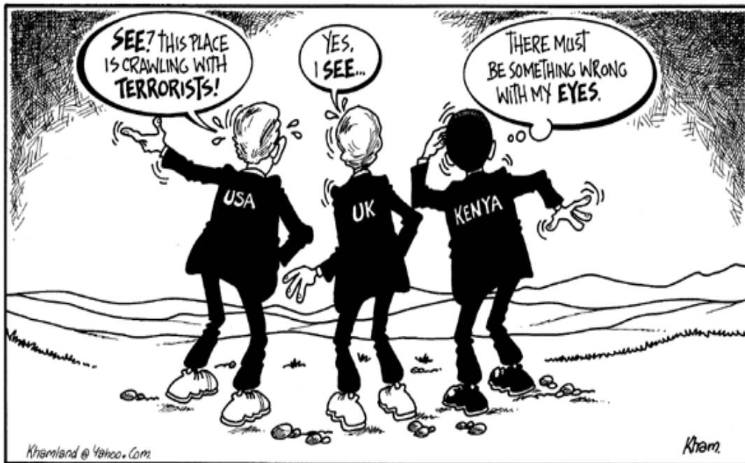
Figure 5: US, UK and Local Perception of Kenya's Terrorist Threat

Source: Editorial Cartoon, Daily Nation , June 24, 2003